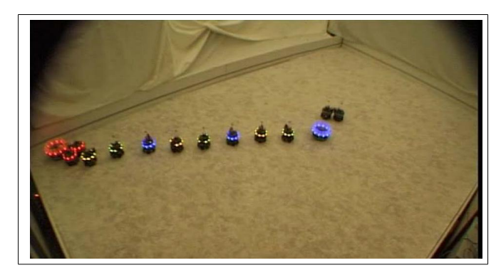
Fig.3 The object search and retrieval scenario.

robot. Additionally, the robots' sensing and communication capabilities are local and the robots' actions are neither directed by a centralised controller nor based on any global knowledge. In this field, I have coordinated two European projects: Swarm-bots and Swarmanoid.<sup>3</sup>