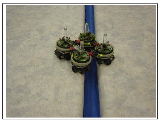
Fig.2 A swarm-bot made of four s-bots attached to each other can pass over a trough that is too large for a single s-bot.

My group has also contributed to particle swarm optimization research [13, 10]. In particular, we have proposed a novel high-performing PSO algorithm called Frankenstein's PSO [15], and the use of incremental learning techniques within PSO [16].