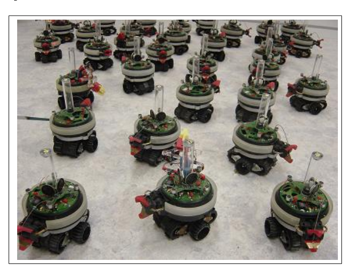
Fig.1 A swarm of s-bots.

Swarm intelligence deals with natural and artificial systems composed of many individuals that coordinate using decentralized control and self-organization [1, 2, 5]. The main focus of swarm intelligence research is on the collective behaviour that results from local interactions of individuals with each other and with their environment. There are many examples of natural systems that are studied in swarm intelligence research: ant and termite colonies, fish schools, bird flocks, animal herds and even human crowds. There are also a number of human artefacts that are studied: swarms of robots, computer programs that tackle difficult problems in optimization and in data analysis. IRIDIA, the artificial intelligence laboratory at the Université Libre de Bruxelles, is known world-wide for its work in swarm intelligence. In particular, in the last 20 years my research group has been focusing on swarm optimization and on swarm robotics.