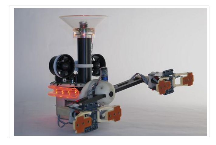
Fig.6 A hand-bot.

the project we built a swarmanoid composed of about 60 autonomous robots of the three above-mentioned types.