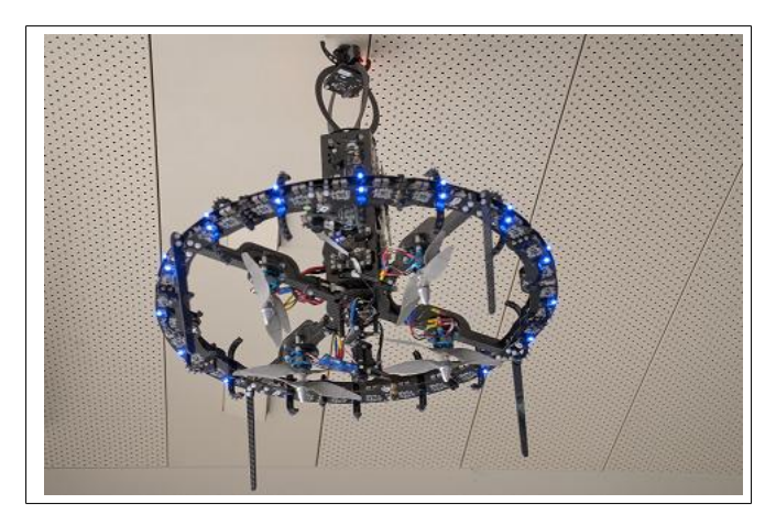
Fig.4 An eye-bot.

The main objective of the Swarm-bots project<sup>4</sup> was to study a novel approach to the design and implementation of self-organising and self-assembling artefacts. One of the main achievements of the project was the design, construction and control of 35 s-bots (Fig.1), autonomous robots capable of grasping each other using a gripper and to communicate using sound and colour. By grasping each other, s-bots form bigger connected structures that we call swarm-bots. A swarm-bot can perform tasks that a single s-bot cannot. An example is given in (Fig.2).