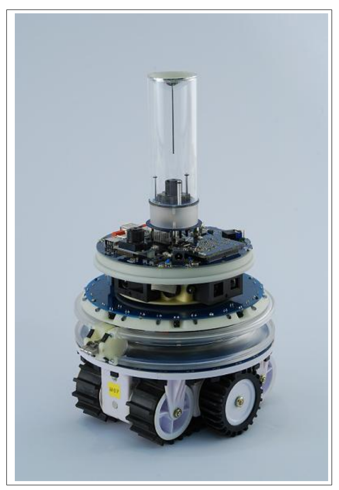
Fig.5 A foot-bot.

a large environment so that, given their limited sensing capabilities, the s-bots also needed to cooperate both to find the object and to find an appropriate path to the goal location. An illustration of the experimental environment is shown in Figure 3. The interested reader can find detailed descriptions of the results of these experiments in [17].